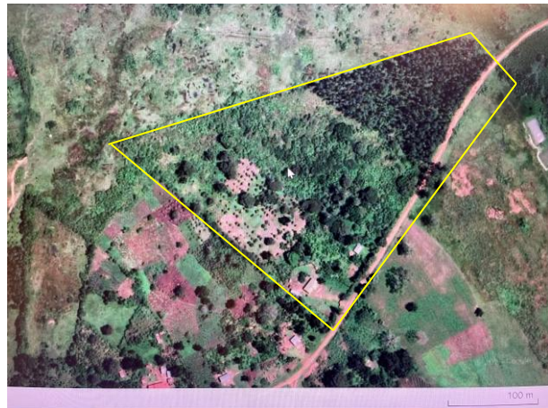
15 acres of land

Assisting the project will be EMI East Africa ( https://emiworld.org/ ) a Christian mission organisation dedicated to architectural and management support of Christian engineering projects. EMI have already agreed to provide, a detailed construction design and project management for the proposed project.