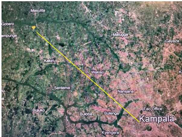
Location of land – 30km from Kampala

Progressively over phases, the site will be developed as a conference centre together with a car park and gardens keeping the woodland as a quite place for relaxation.