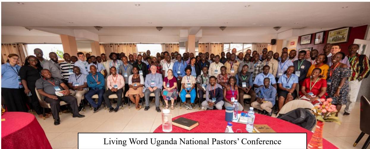
Living Word Uganda National Pastors' Conference

"We are so hungry for this kind of teaching. It is exactly what our country so desperately needs."